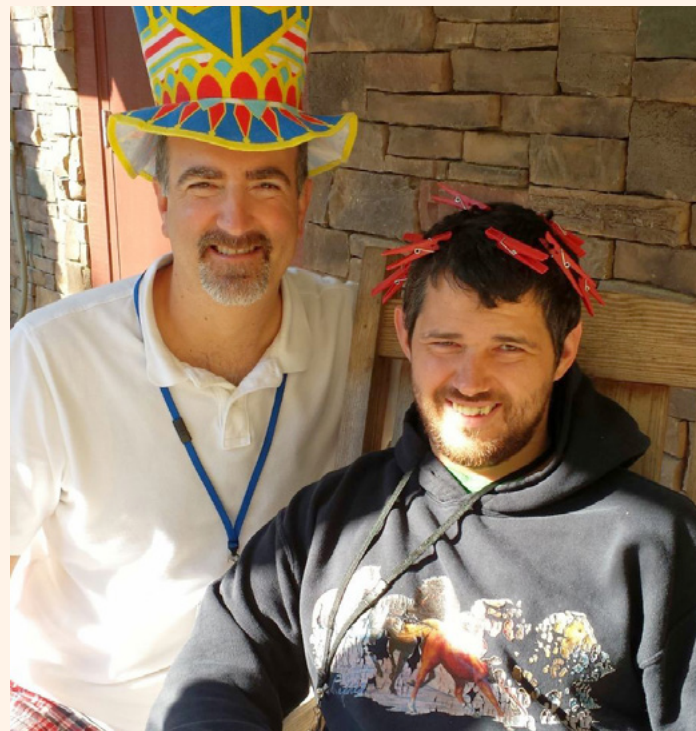
The impact of Family Retreat lasts so much longer than just one week. It's a catalyst for life-long discipleship!