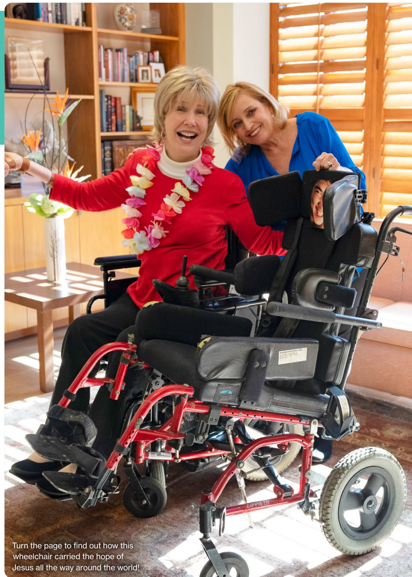
Turn the page to find out how this wheelchair carried the hope of Jesus all the way around the world!