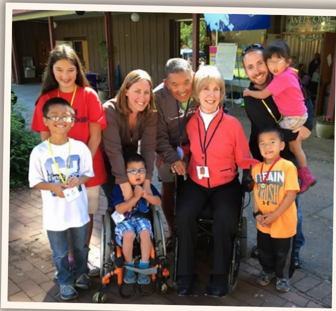
Family Retreat brings the whole family closer to each other and closer to Jesus!