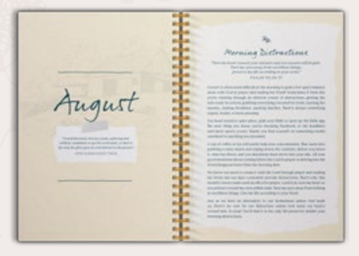
You will love these new monthly devotionals by Joni!