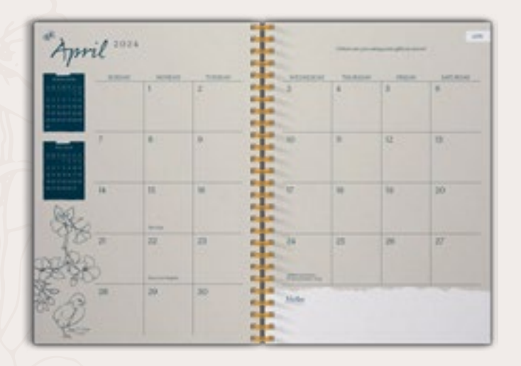
Stay God-focused as you plan out your days, weeks, and year.