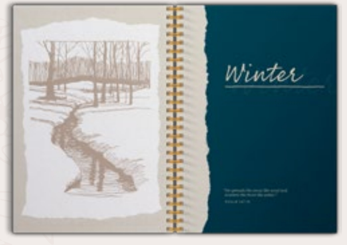
Be blessed by the Bible verses and inspiring messages and quotes from Joni all throughout the Planner.