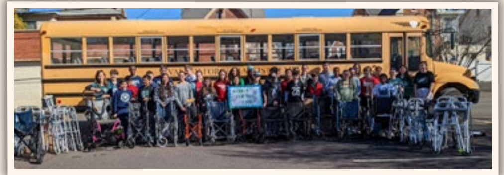
Volunteer opportunities are endless and always life-changing! Pray about how you can get involved today!

These middle school students and their classmates were deeply touched through their volunteer service with Joni and Friends. What started with a wheelchair collection drive turned into hearts changed and eyes opened. And after hearing more about Joni and Friends in their school’s chapel time, students, parents, and Valley Forge Baptist Academy staff members created Happy Grams for our five Pennsylvania Retreats & Getaways —delivering handwritten encouragement to hundreds of families living with disabilities.