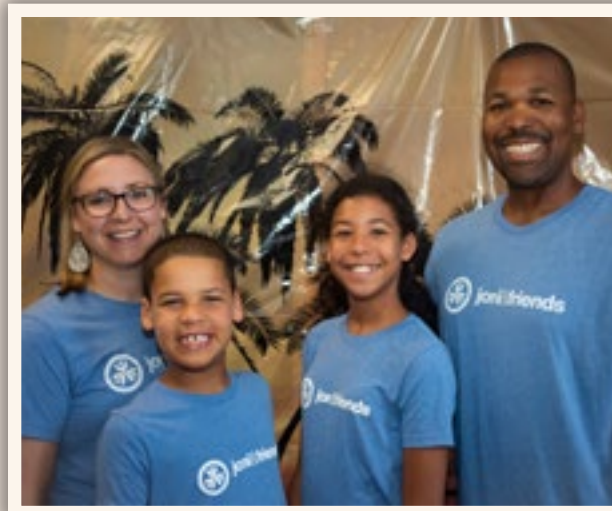
Thank you for showing special needs families the never-ending love of Jesus!