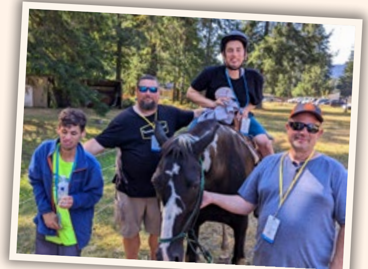
Family Retreat makes impossible dreams possible.