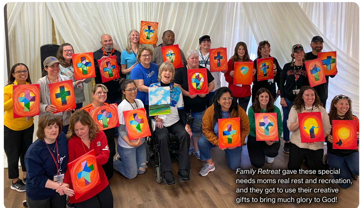
Family Retreat gave these special needs moms real rest and recreation, and they got to use their creative gifts to bring much glory to God!