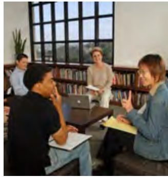
≈ 2000 Groundwork is laid for the Christian Institute on Disability , the education center of Joni and Friends, as Joni actively campaigns against stem cell research.