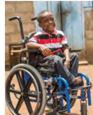
≈ 2014 Wheels for the World delivers its 100,000th wheelchair.