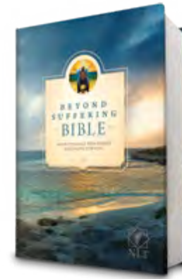
≈ 2016 The Beyond Suffering Bible is released.