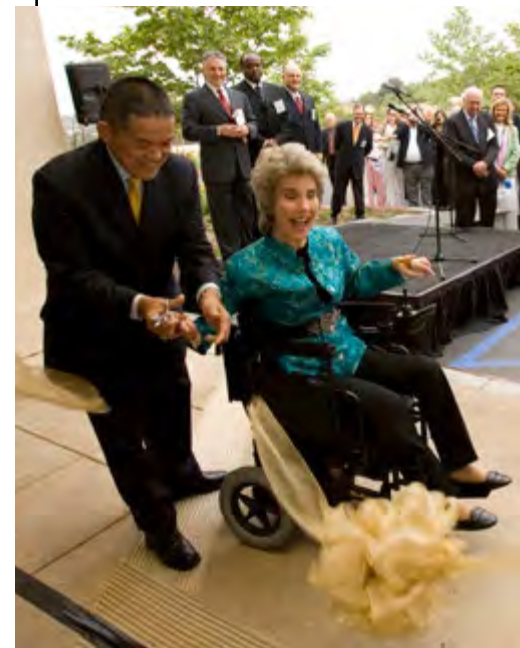
≈ 2007 In January, the Joni and Friends International Disability Center opens its doors, ushering in a new era of international outreach to families affected by disability.