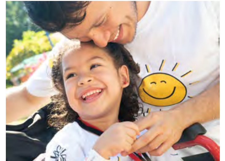
≈ 2019 Celebrating 40 Years of your faithfulness and ministry! You've partnered with us to reach the next generation with the love of Jesus for many years to come!